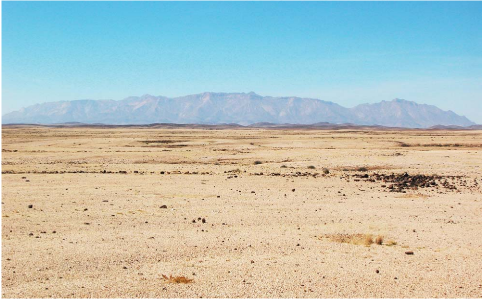
Fig. 1. Brandberg Massif (Namibia), gravel plains southwest, facing northeast to Massif in distance, dry year. Gravel plains, habitat of Parabuthus brevipanus (Thorell, 1876), Parabuthus namibensis Lamoral, 1979 and Uroplectes gracilior Hewitt, 1913.