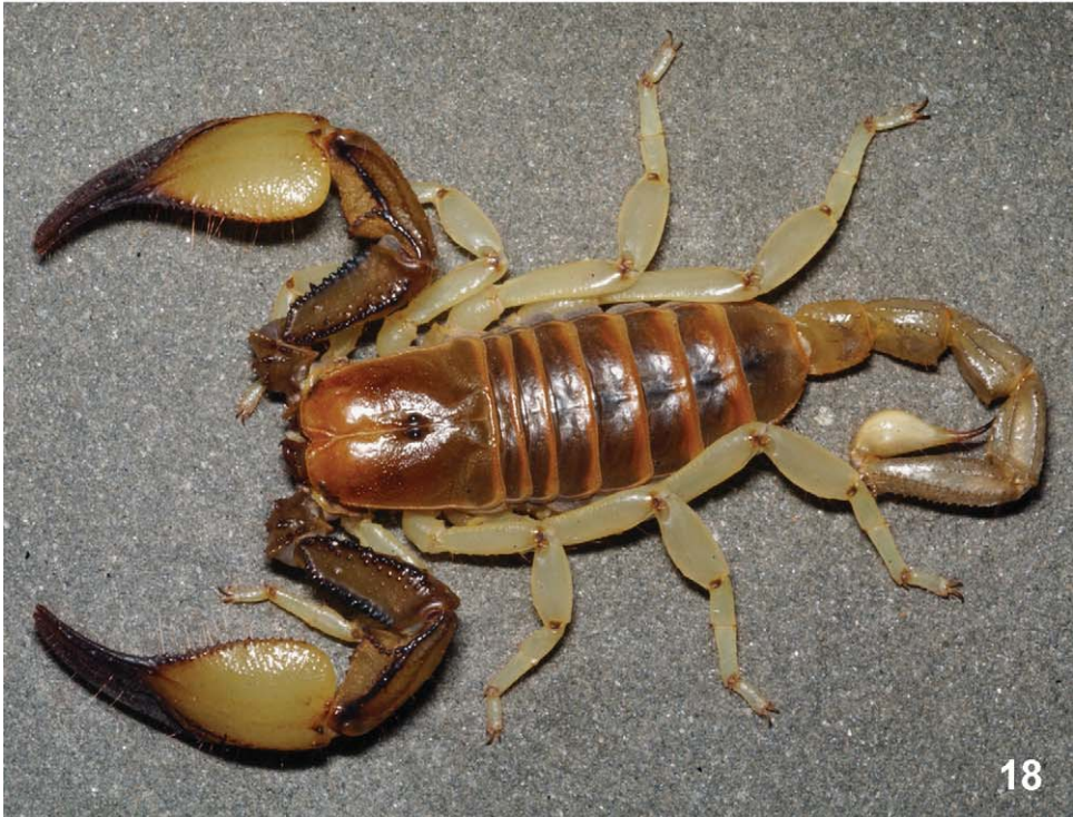
Figs 17, 18. Adult males, habitus in life: (17) Hadogenes tityrus (Simon, 1888); (18) Opisthophthalmus carinatus (Peters, 1861).