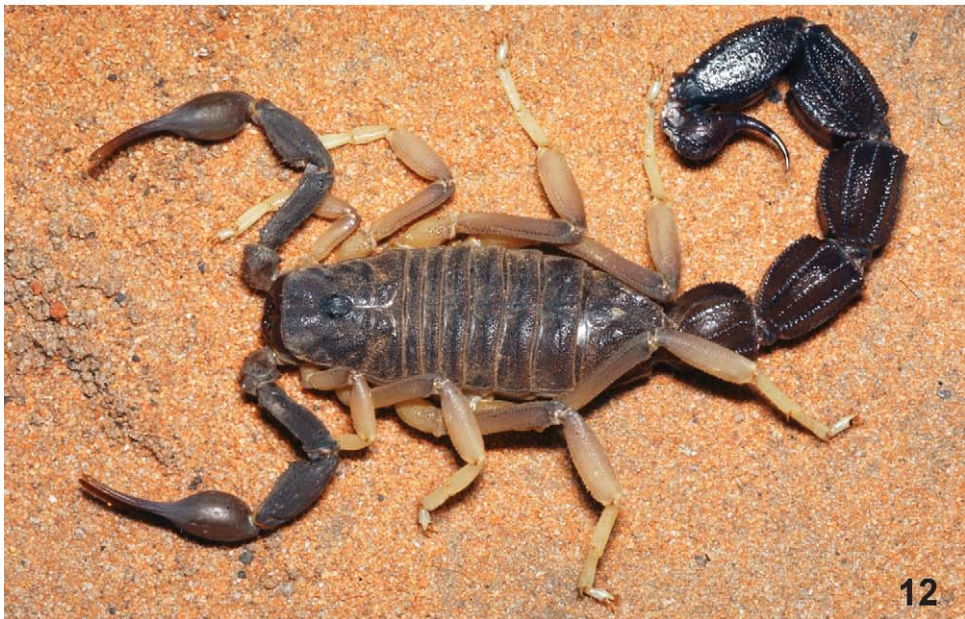
Figs 11, 12. Parabuthus adults, habitus in life: (11) P. gracilis Lamoral, 1979, female; (12) P. granulatus (Ehrenberg, 1831), male.