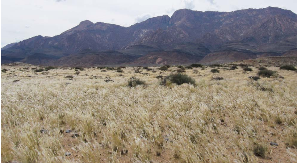
Fig. 3. Brandberg Massif (Namibia), gravel plains and foothills southeast, facing northwest to Massif, wet year. Dominant vegetation, Euphorbia damarana L.C. Leach and Stipagrostis sp. Gravel plain, habitat of Parabuthus brevimanus (Thorell, 1876), Parabuthus granulatus (Ehrenberg, 1831). Rocky foothills, habitat of Parabuthus villosus (Peters, 1862) and Opisththalmus lamorali Prendini, 2000.