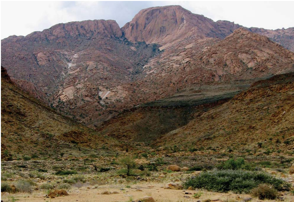
Fig. 4. Brandberg Massif (Namibia), base of Massif at entrance to Goaseb (Ga-Asab) Gorge, facing north to Orabeskopf at summit, wet year. Dominant vegetation, Boscia foetida Schinz and Commiphora sp. Rocky flats, habitat of Hottentotta conspersus (Thorell, 1876), Parabuthus brevimanus (Thorell, 1876), Parabuthus villosus (Peters, 1862), and Opisththalmus lamorali Prendini, 2000.