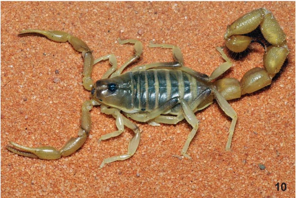
Figs 9, 10. Adult females, habitus in life: (9) Hottentotta conspersus (Thorell, 1876); (10) Parabuthus brevimanus (Thorell, 1876).