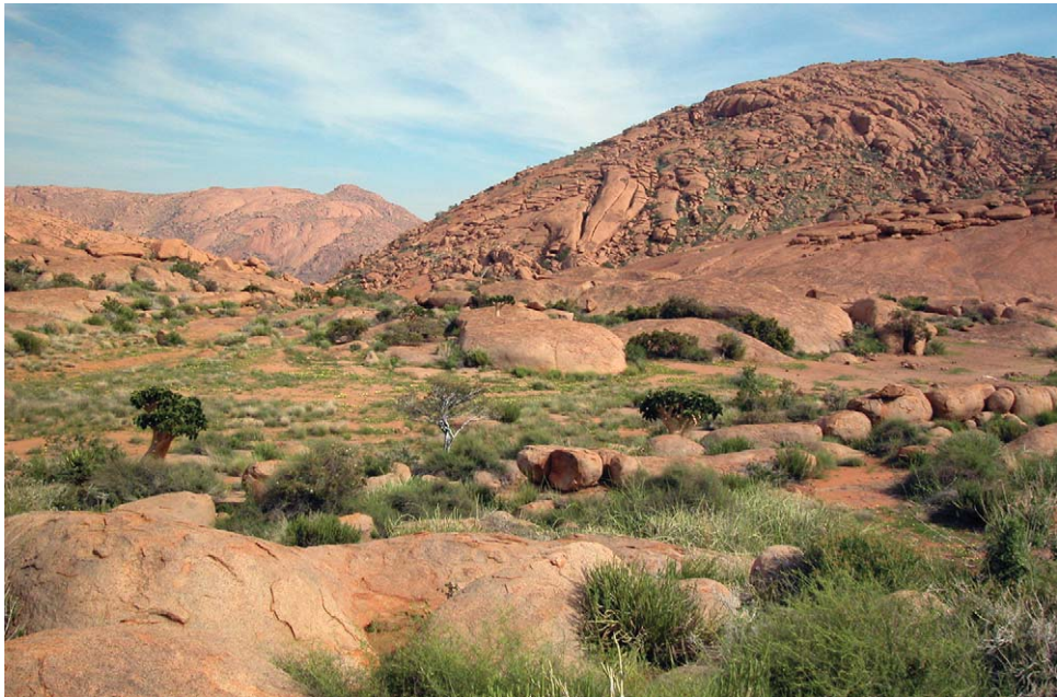
Fig. 8. Brandberg Massif (Namibia), Wasserfallfläche, plateau on summit of Massif, facing southwest, wet year. Dominant vegetation, Boscia albitrunca (Burch.) Gilg & Gilg-Ben., Cyphostemma currorii (Hook.f.) Desc. and Euphorbia sp. Rocky flats and slopes, habitat of Lisposoma elegans Lawrence, 1928, Hadogenes tityrus (Simon, 1888) and Uroplectes planimanus (Karsch, 1879). Sandy flats, habitat of Parabuthus brevimanus (Thorell, 1876) and Opisththalmus carinatus (Peters, 1861). Woody vegetation, habitat of Uroplectes otjimbinguensis (Karsch, 1879).