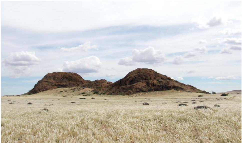
Fig. 2. Brandberg Massif (Namibia), granitic inselberg south, surrounded by low sand dunes, leading down to sandy plain, facing west, wet year. Dominant vegetation, Euphorbia damarana L.C. Leach and Stipagrostis sp. Dunes, habitat of Parabuthus gracilis Lamoral, 1979 and Opisththalmus jenseni (Lamoral, 1972). Sandy plain, habitat of Parabuthus brevipanus (Thorell, 1876), Parabuthus granulatus (Ehrenberg, 1831) and Opisththalmus wahlbergii (Thorell, 1876).