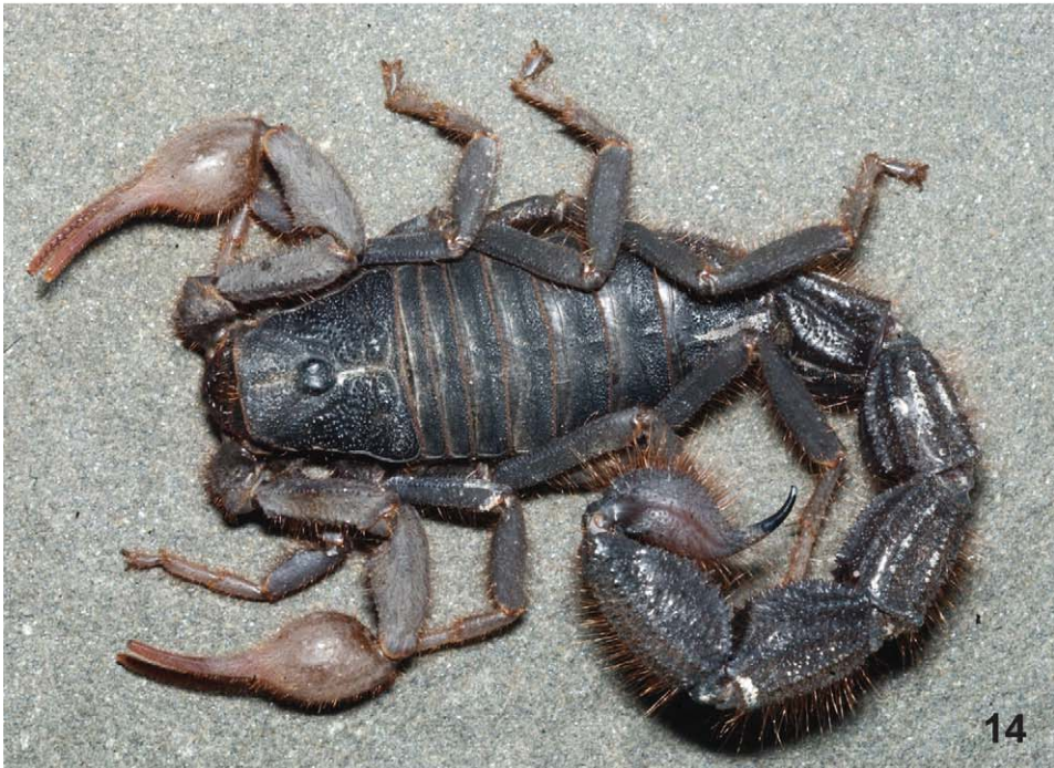
Figs 13, 14. Parabuthus adults, habitus in life: (13) P. kraepelini Werner, 1902, female; (14) P. villosus (Peters, 1862), male.