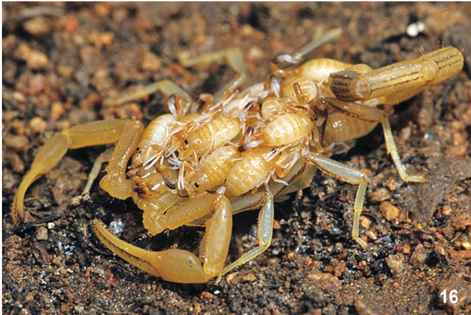
Figs 15, 16. Uroplectes adults, habitus in life: (15) U. gracilior Hewitt, 1913, male; (16) U. planimanus (Karsch, 1879), female with brood.