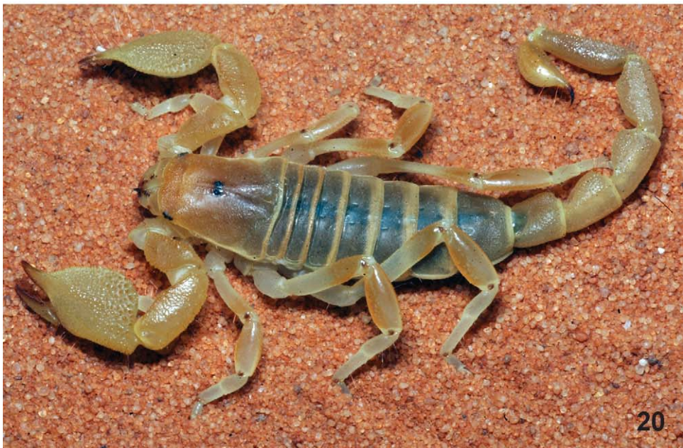
Figs 19, 20. Opisthophthalmus adult males, habitus in life: (19) O. lamorali Prendini, 2000; (20) O. jenseni (Lamoral, 1972).