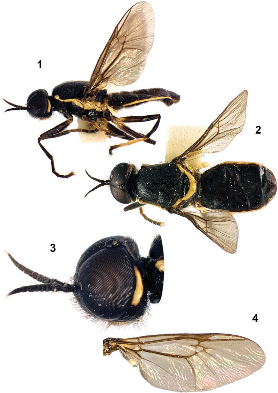
Figs 1–4. Briannyia stuckenbergi gen. & sp. n., holotype: (1) dorsal view; (2) lateral view; (3) head and antenna, lateral view; (4) wing.