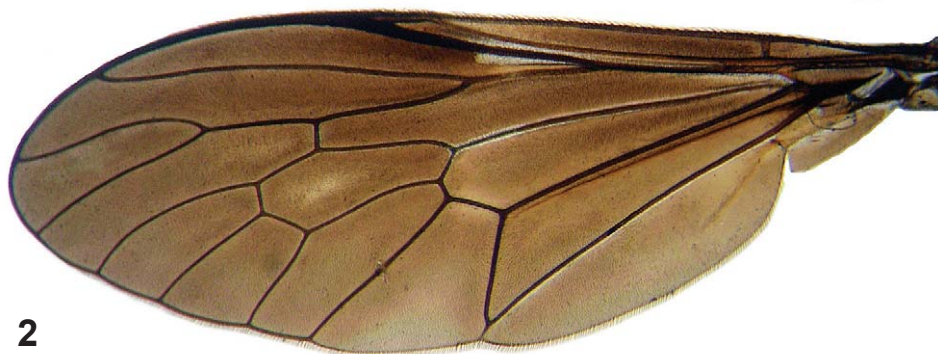
Figs 1, 2. Akatiomyia eremnos gen. et sp. n., male: (1) entire holotype, (2) left wing of paratype.

Thorax : Dark red-brown to black, extensively shiny apruinose, macrosetae poorly developed brown-red, fine setae pale yellow-white. Prothorax small, narrow with single row of moderately developed brown-red anteprenotal macrosetae. Mesonotum: Short and broad (Fig. 5), shiny apruinose except for narrow silver pruinose posterolateral and posterior margins; macrosetae not evident except for 3 moderately developed brown-red supra-alars; all fine mesonotal setae, which cover entire mesonotum, arise from shallow depressions, giving surface punctate appearance. Scutellum shiny apruinose, covered with fine, tiny whitish setae, apical macrosetae absent. Pleura dark red-brown to black, extensively silver pruinose except for substantial areas of anepisternum, katapisternum, meron and anepimeron which are shiny apruinose; setae white, largely confined to anepisternum and katatergite. Mediotergite largely silver pruinose except