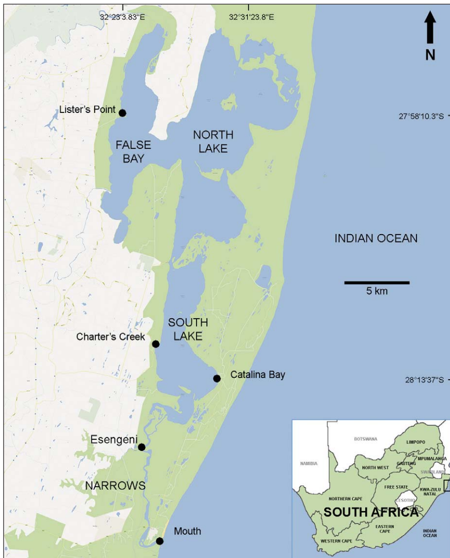
Fig. 2. Map of the St Lucia estuarine lake, showing the main basins and stations within the system.

and South Lake), which are generally connected to the Indian Ocean through a narrow, long channel known as the 'Narrows'. The estuarine lake is susceptible to periodic large-scale fluctuations in physico-chemical characteristics due to stochastic flood and drought events, and has recently experienced a prolonged period of virtually uninterrupted mouth closure since 2002 (Whitfield & Taylor 2009; Cyrus et al. 2011).