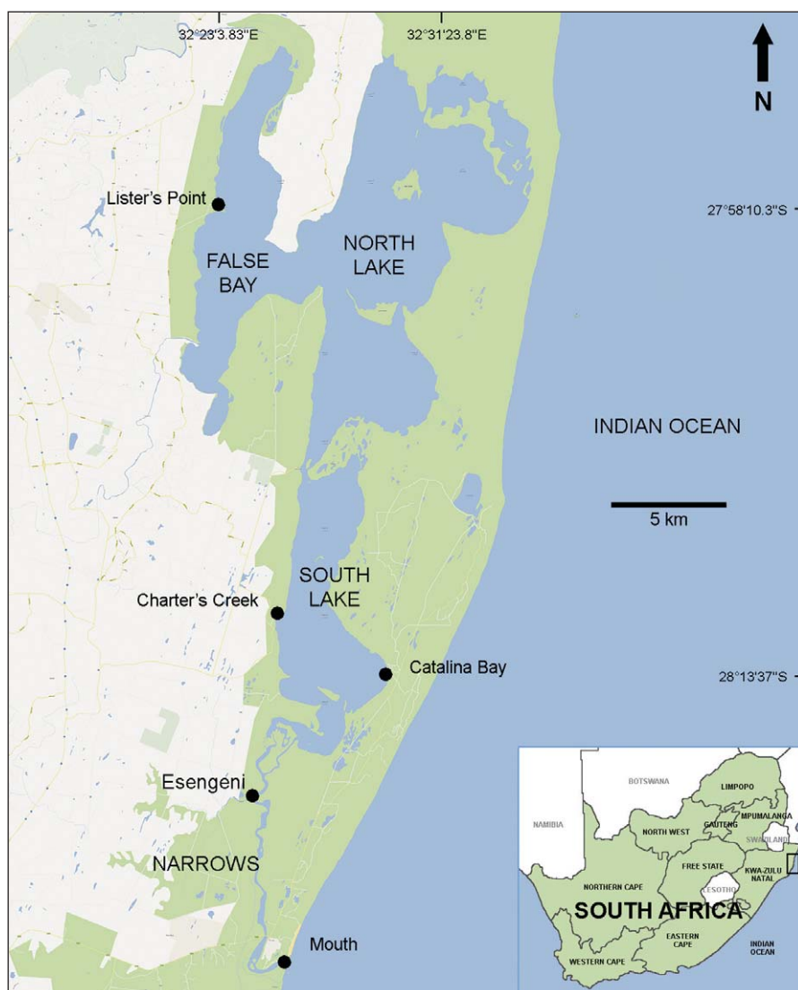
Fig. 2. Map of the St Lucia estuarine lake, showing the main basins and stations within the system.

and South Lake), which are generally connected to the Indian Ocean through a narrow, long channel known as the 'Narrows'. The estuarine lake is susceptible to periodic large-scale fluctuations in physico-chemical characteristics due to stochastic flood and drought events, and has recently experienced a prolonged period of virtually uninterrupted mouth closure since 2002 (Whitfield & Taylor 2009; Cyrus et al. 2011).