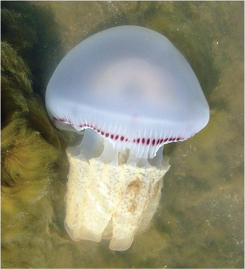
Fig. 1. Large specimen ( \approx 16 cm bell diameter) of Crambionella stuhlmanni in the shallows of Charter's Creek. (Photo Nicola K. Carrasco, 29 May 2008)

logical characters of specimens collected in the St Lucia Estuary (Neethling et al. 2011). No ecological or behavioural information was, however, included either in the work of Neethling et al. (2011) or in the studies conducted prior to this. C. stuhlmanni is apparently endemic to the East African coastline and has been recorded in the St Lucia Estuary since the very earliest surveys conducted there. Apart from St Lucia, the currently known distribution for the species includes the coasts of Mozambique and Madagascar (Neethling et al. 2011).