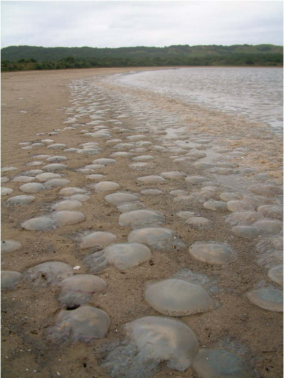
Fig. 4. Swarming Crambionella stuhlmanni washed up on the shore of Catalina Bay. (Photo Ricky H. Taylor, Dec. 2005)

centrations of 1.3 \text{ ind.m}^{-3} obtained in this study at Lister's Point during May 2008 were recorded 9 months after the re-closure of the mouth. Occasional occurrences have been recorded at least until November 2011 at Catalina Bay, well over four years since the