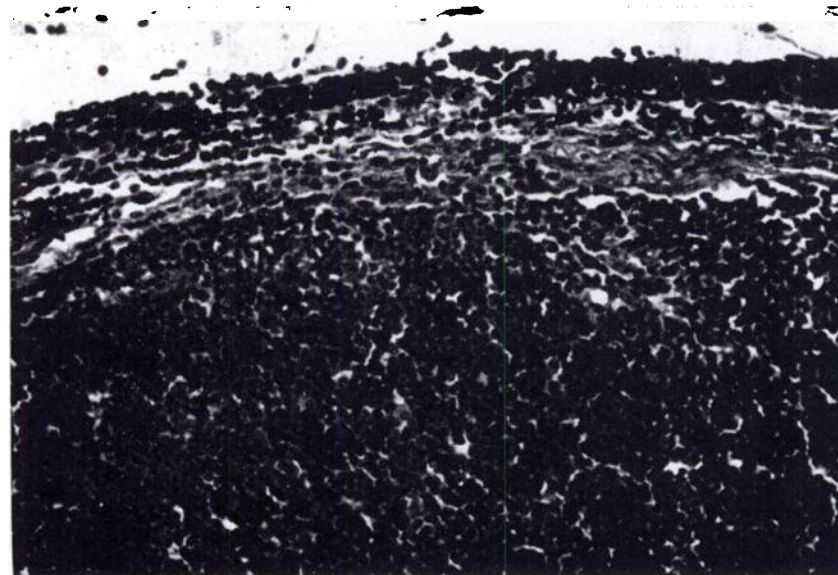
FIGURE 2. Thymic lymphoma in one thymus of a female white-footed mouse. Only \frac{1}{8} of the width of the thymus is shown. X 125.