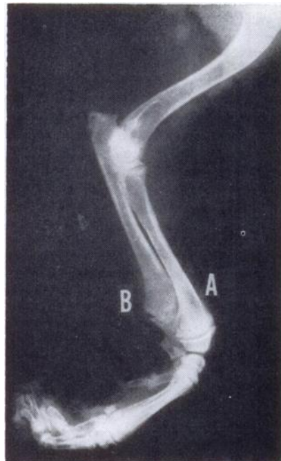
FIGURE 1. Lateral radiograph of the right forelimb. Notice the thinning of the distal cortices of the radius (A) and ulna (B) and the transverse widening of the metaphyses at the epiphyseal line. There is suggestive lipping of the margins of the metaphyses.

varied from dull-pink to dull-gray. Most kits were affected with a mild bilateral conjunctivitis. Facial enlargement was not encountered in any of the kits. There were palpable bilateral enlargements of the distal epiphyses of the radius and ulna, the distal epiphyses of the femur, and the costochondral junctions of the ribs. The radius and ulna were slightly bowed posteriorly. Most of the kits had