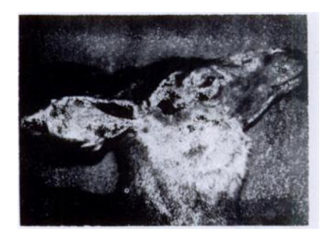
FIGURE 1. Severe alopecia of the muzzle, face, ears and skull areas. Note the keratin flakes in and on the ears.

Internal examination revealed a thin, emaciated carcass with severe depletion of fat depots and concomitant serous