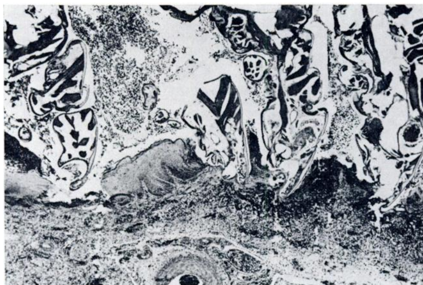
FIGURE 3. Oral mucosa: Epithelial ulceration at site of louse attachment, with submucosal hemorrhage and heterophil infiltration. Bodies of lice are surrounded by hemorrhagic debris. Hematoxylin-eosin. x 45.