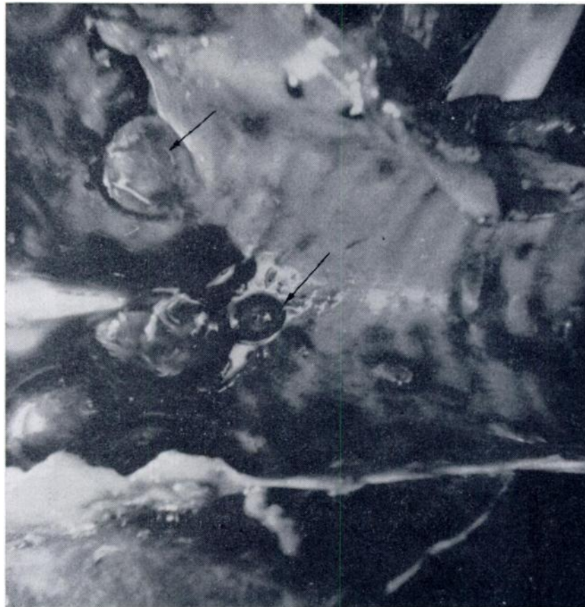
FIGURE 1. Nodules containing Filaroides osleri (arrows) at the tracheal bifurcation of a juvenile coyote.

Although Alaria americana was found in the small intestine of all 13 coyotes, there were no gross lesions observed associated with its presence. In dogs the parasite is not regarded as a significant pathogen, though a catarrhal duodenitis has been observed in certain cases. 12 Allen and Mills' study in Saskatchewan revealed no clinical signs and only mini-