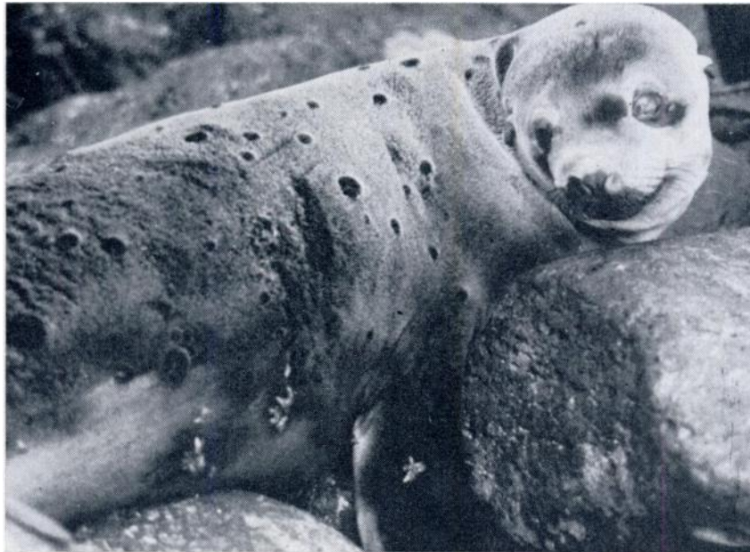
FIGURE 1. Stricken Galapagos sea lion with multiple cutaneous nodules, some with clusters of muscid flies.

Cultures of blood and pus, carried out 3 weeks later (during which interval re-