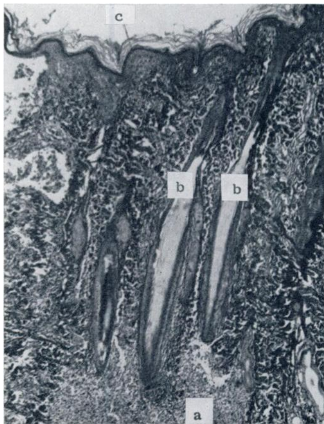
FIGURE 2. Section through smaller skin nodule with leucocytic invasion restricted to subcutis (a). Suppuration is advancing to hair follicles (b). The epidermal layers (c) are still intact. Hypertrophy, hyperplasia and cell inclusions are absent.

Sections through skin nodules and abscess wall (Figs. 2, 3) showed normal or reduced thickness of the stratum spinosum. Neither hypertrophy nor hyperplasia of the epidermal epithelium was