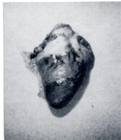
FIGURE 4. Duck virus enteritis (duck plague) in a black duck. Hemorrhages in the heart.