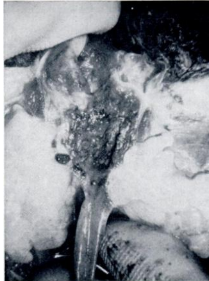
FIGURE 3. Duck virus enteritis (duck plague) in a black duck. Fibro-necrotic plaques in the cloaca.

Virus was isolated from liver, kidney, spleen and intestines of each of the three black ducks. The CAMs of inoculated eggs were thickened. CAM suspensions