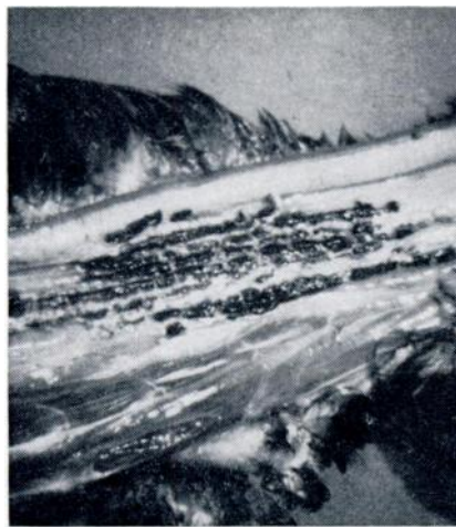
FIGURE 2. Duck virus enteritis (duck plague) in a black duck. Fibro-necrotic plaques in the esophagus.