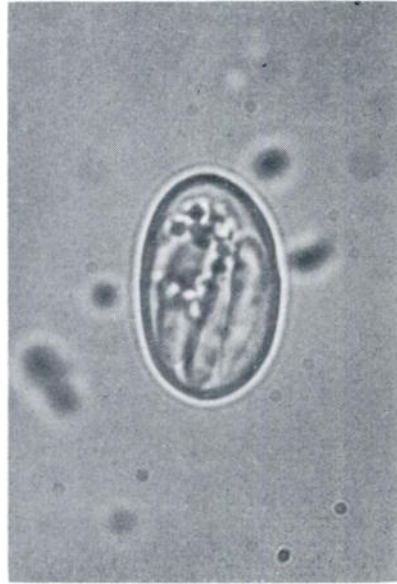
FIGURE 1. Sarcocystis sporocyst. X1600.