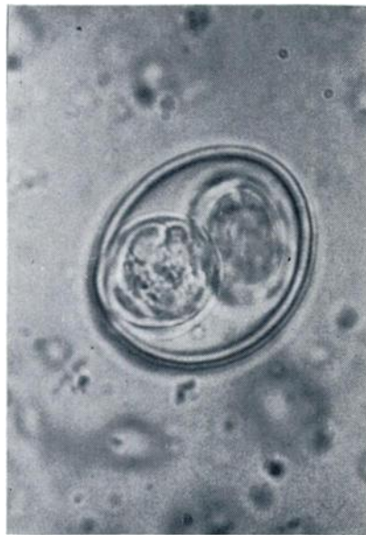
FIGURE 2. Sporulated oocyst of Isospora ohioensis . X1000.

wall were frequently observed. One hundred sporocysts from 13 samples measured 14.0-17.0 by 8.5-10.5 \mu\text{m} (average 16.0 by 9.6). The majority of the fecal samples with Sarcocystis contained from 10-300 sporocysts per g, although one sample was estimated to contain over 760,000 sporocysts per g.