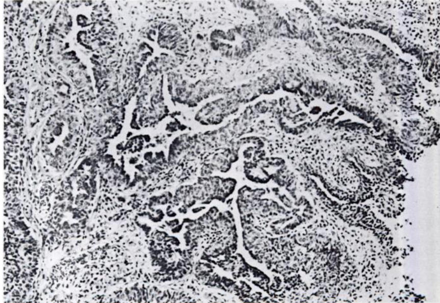
FIGURE 1. Proliferation of squamous tonsillar epithelium and its invasion in deep clefts. H&E \times 63 .