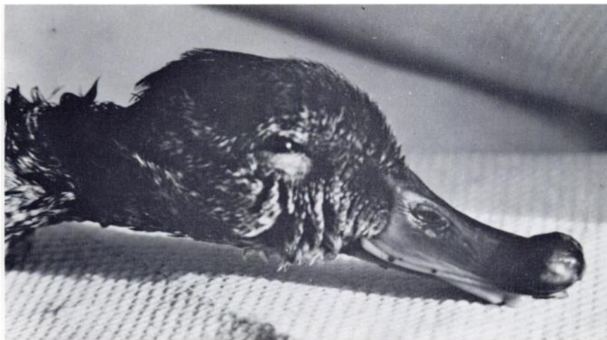
FIGURE 1. American green-winged teal with raised nodular avian pox lesion on tip of bill.

Avian pox in free-living Anseriformes was not reported until 1969 when Leibovitz diagnosed it in a young mute swan ( Cygnus olor ) in New York. He described macules, papules, scabs and ulcers on unfeathered parts of the skin. He