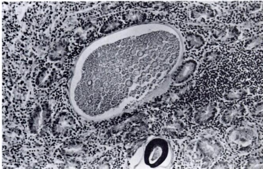
FIGURE 1. Section of the jejunum of a camel showing a schizont of E. cameli in the early formative stage - with small rings of nuclei. A thick-walled oocyst lies below the schizont. H&E \times 100 .

The classification of the various protozoan pseudocysts has caused much con-