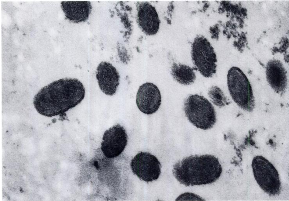
FIGURE 4. Viral particles in lesion of contagious ecthyma from a pronghorn 10 days postexposure. \times 120,000 .