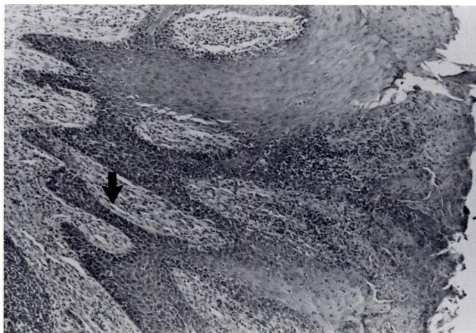
FIGURE 3. Photomicrograph of lesion of contagious ecthyma in a mule deer 10 days postexposure. Note epidermal peg formation (arrow) (H&E). \times 87 .