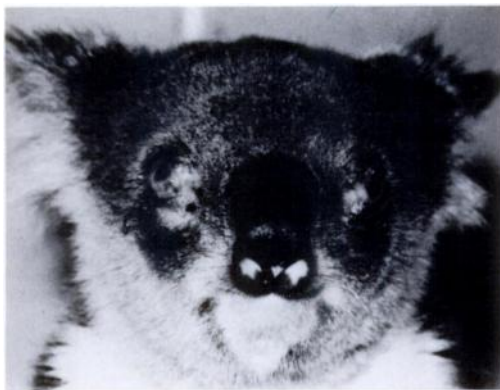
FIGURE 3. An example of keratoconjunctivitis in a koala.

et al., 1977). These point estimates are reported along with lower and upper bounds of the 95% confidence interval (Fleiss, 1981). Additionally, six other koalas had mild degrees of corneal scarring characterized by centralized, circular opaque regions which did not seem to interfere with vision. The conjunctival tissues from only one of these six koalas yielded C. psittaci .