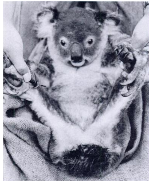
FIGURE 2. An example of “dirty tail” in a koala.

The comparisons between these cases and the isolation of C. psittaci in tissue culture are shown in Table 2. The sensitivity and specificity of diagnosing infected koalas by clinical signs of disease in this study were determined to be 13% (5, 25) and 100% (76, 100), respectively (Schwabe