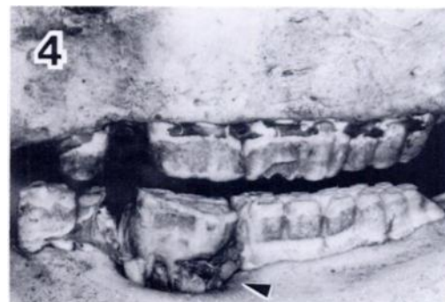
FIGURE 4. Grade 3 lesions and the accumulation of fibre at the second lower molar of an 18- to 25-mo-old warthog from Nagupande, Zimbabwe. The upper first molar has been lost and part of the crown of the lower first molar is missing without apparent periodontal disease.