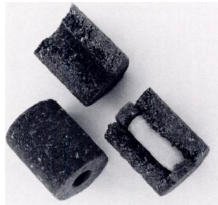
FIGURE 2. Fishmeal polymer bait and wax ampule.

Mammalian species composition on Parramore Island included both target and nontarget species: raccoons ( Procyon lotor ); red foxes ( Vulpes vulpes ); white-tailed deer; river otters ( Lutra canadensis ); grey squirrels ( Sciurus carolinensis ); and eastern cottontail rabbits ( Sylvilagus floridanus ). Raccoon tracks and scat were abundant on Parramore Island; red foxes were occasionally seen (approximately once a week) and scats and tracks were easily found. Sightings of white-tailed deer were frequent (approximately one every 2 to 3 days). River otter sign was present only at two sites on Parramore Island. Grey squirrels were observed only on the north end of Parramore Island near the Coast Guard station. There were three sightings of eastern cottontail rabbits on the island. Three hundred small mammal trap nights (Sherman live-traps) yielded only one marsh rice rat ( Oryzomys palustris ) and two house mice ( Mus musculus ). The other small mammals previously reported on Parramore Island (Dueser et al., 1976, 1979), muskrats ( Ondatra zibethicus ), meadow voles ( Microtus pennsylvanicus ),