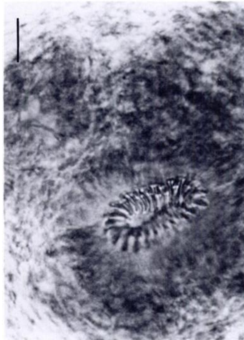
FIGURE 2. Scolex of Taenia mustelae showing small hooks measuring about 20 \mu m in length. Bar = 40 \mu m.