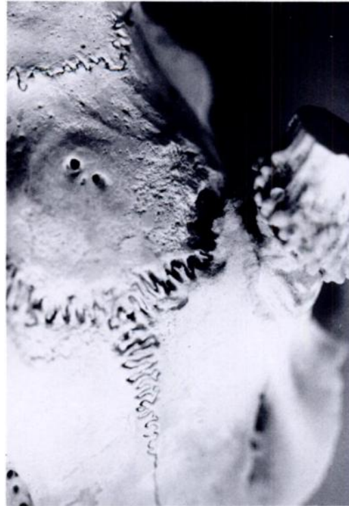
FIGURE 2. Erosion and pitting of the frontal bone and antler pedicel in an adult male white-tailed deer with a cerebral abscess.

may have contributed to development of abscesses were identified (Table 1). Fractured antler pedicels or subcutaneous abscesses around the antler pedicels were each noted in seven bucks. Records for 10 bucks contained specific descriptions of tract-like lesions extending through or between cranial bones. The following were considered contributory to formation of intracranial abscesses in two bucks each (1) subcutaneous abscesses on the head or ears due to ticks ( Amblyomma spp.), (2) bacterial otitis due to ear mites ( Psoroptes cuniculi ), and (3) known or suspected intraspecific trauma.