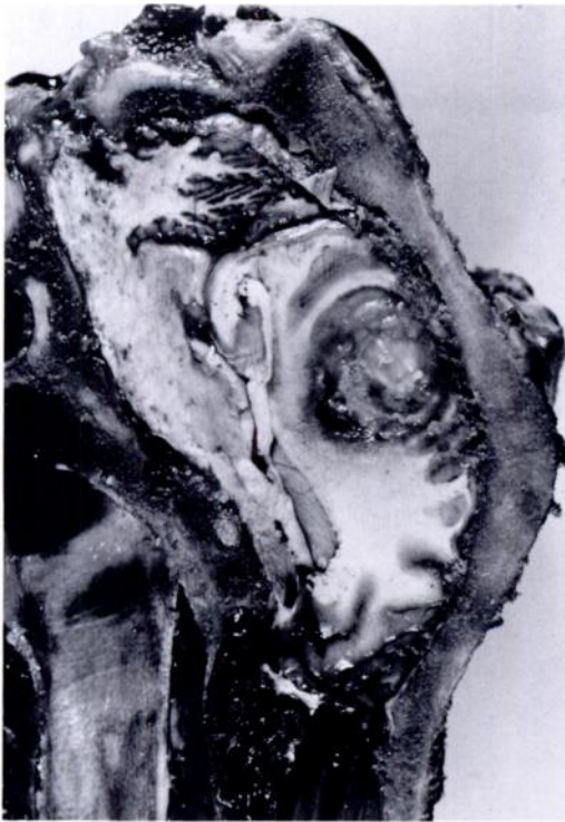
FIGURE 1. Cerebral abscess surrounded by inflammation in the cerebrum of an adult male white-tailed deer.