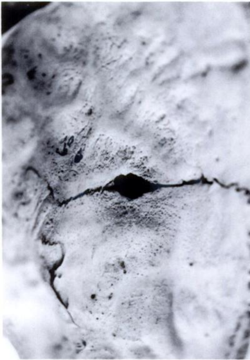
FIGURE 3. Pitting of inner surface of cranial vault adjacent to necrotic and eroded suture between frontal bones in an adult male white-tailed deer which had a cerebral abscess.

signed a risk factor of 1, odds ratio testing disclosed that 1- to 3-yr-old bucks were 13 times more likely and bucks \geq 4 -yr-old were 38 times more likely to be affected than the youngest bucks were. Of 19 males for which antler status was recorded, 13 (68%) had hard, polished antlers and six (32%) had recently cast antlers or had velvet-covered pedicels.