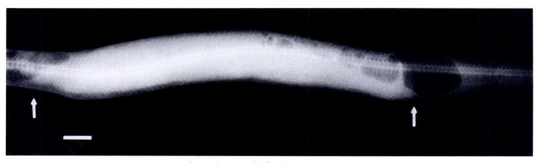
FIGURE 1. Dorsoventral radiograph of the caudal body of a Burmese python demonstrating an ovoid soft tissue mass cranial to the cloaca in the region of the umbilicus. Arrows delineate the cranial and caudal margin of the mass. Bar = 1 cm.

ing large intestinal loops, were seen caudal to the mass. The origin of the mass could not be determined.