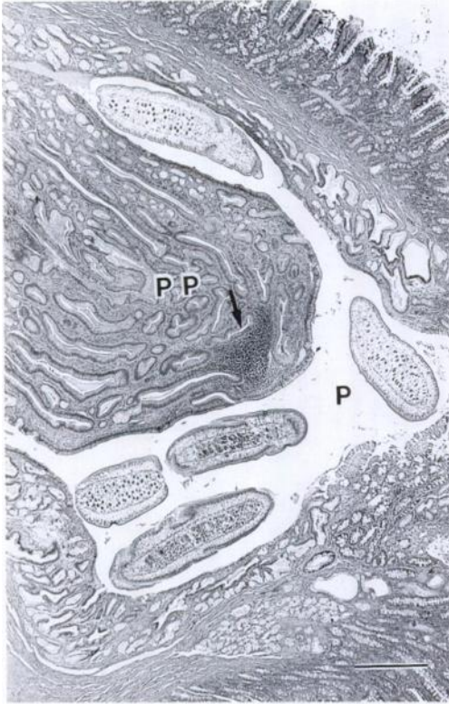
FIGURE 3. Atriotaenia procyonis within proximal pancreatic duct (P) and hyperplasia of mucosal cells, causing the formation of an extensive papillary projection (PP) into the duct lumen. A focal area of inflammatory cells (arrow) is seen in the submucosa and mucosa of the duct. Bar = 100 \mu m.

sites in the pancreatic duct of other animals (pig, dog, horse) has been reported (Hamir, 1987).