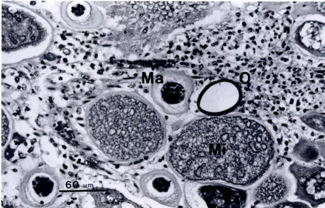
FIGURE 2. H&E. 2. Microgametocytes (Mi), macrogametes (Ma) and oocyst (O) of Eimeria arundeli from a common wombat. The contents of the oocyst are missing (artefact). Fibrinopurulent exudate in the lamina propria of the mucosa above the oocyst. H&E.

In case one, scattered gametocytes were detected in the lamina propria of the colon, a location where they have not been observed previously. Schizonts are unknown in this species (Barker et al., 1979) and a search for them in the gastrointestinal tract, liver and biliary epithelium of this animal was unrewarding. Sections of the lung were congested, and occasionally alveoli contained some proteinaceous fluid, and a few neutrophils. In both cases, lesions were not present in other tissues. Lymphoid involution in splenic white pulp was not marked.