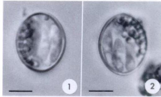
FIGURES 1–2. Nomarski interference contrast photomicrographs of sporocysts of Frenkelia microti isolated from a red-tailed hawk, Buteo jamaicensis . Scale bars = 5.0 μm.

Of all animals inoculated initially with sporocysts, only a single prairie vole inoculated with sporocysts from a red-tailed hawk (isolate SAR-13) became infected (Figs. 1–2, Table 1). The hawk that produced these sporocysts was an adult female, found near Manhattan, Kansas (39°15'N, 96°36'W), and submitted to the KSU College of Veterinary Medicine in November 1990. Preliminary examination revealed marked depression with hemorrhage from around the mouth and nares, tacky mucous membranes, and swelling around the right eye. Based on radiographs, pellet shot densities were observed adjacent to the proximal portion of the right ulna, in the neck, and in the head. With an ophthalmologic examination, it was noted that the right eye had a detached