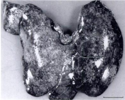
FIGURE 1. Liver of a muskrat with massive infection with Capillaria hepatica . Serpiginous necrotic tracts are seen under the liver capsule (arrow). Bar = 1 cm.

Histologically, infected livers had multifocal areas of C. hepatica infection, varying in severity. In mild cases single eggs or small groups of eggs were found among hepatocytes, without inflammation or with a minimal mononuclear infiltrate surrounding them. In more severe infections there was a marked, multifocally coalescent granulomatous, eosinophilic hepatitis replacing the normal hepatic parenchyma; eggs were found within these granulomatous lesions (Fig. 2). Most eggs were intact and in the four- to eight-cell morula stage. Eggshell disruption and dystrophic calcification were present in some. In a few cases adult gravid females occurred within the liver (Fig. 3). These were found either between intact hepatocytes, with no inflammatory infiltrate, or within foci of severe, eosinophilic, granulomatous hepatitis. In general, the most severe hepatic necrosis and granulomatous response was associated with disintegrating adult worms. In cases with dead, disintegrating adult worms and associated granulomatous hepatitis, there was fibrosis, but no liver regeneration was observed.