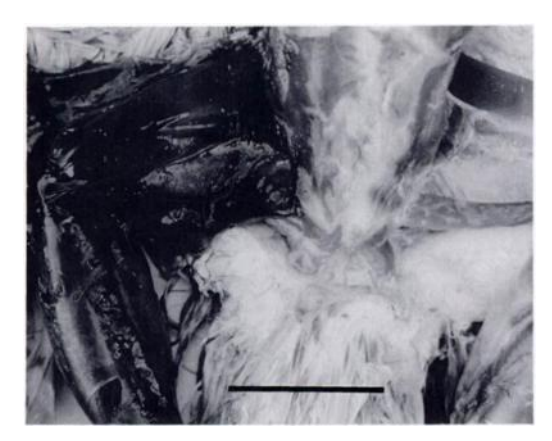
FIGURE 1. Severe hemorrhage and necrosis of the right leg of a red-tailed hawk found in January 1993 in Georgia probably caused by the bite of a cotton-mouth snake. Bar = 5 cm.

While common throughout the entire United States, red-tailed hawks are noticeably more numerous in the southern states in winter. Small mammals are their main prey, but birds, reptiles, amphibians, and insects also are consumed (May, 1935). Of all hawk species, the red-tailed hawk is particularly known to prey on snakes (Knight and Erickson, 1976). Snakes killed