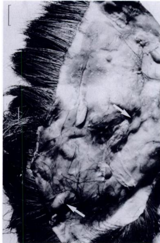
FIGURE 2. Larvae (arrows) within deer skin. Scale bar = 2 cm.

bles and removed with the skin (Fig. 2) and recorded as the total number of Hypoderma spp. larvae parasitizing the host (intensity). Intensity as well as mean intensity and prevalence were defined according to Margolis et al. (1982). Sex and age of animals surveyed were recorded. Deer age was estimated according to Larson and Taber (1980) and three age classes were evaluated: 1 to 2 yr, 3 to 5 yr and >5 yr.