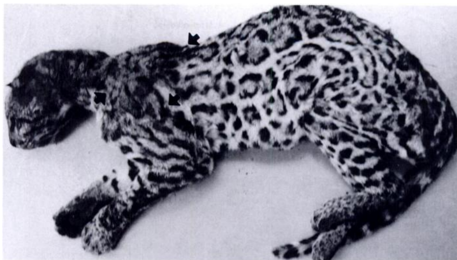
FIGURE 1. Carcass of a mature male ocelot from southern Texas infected with notoedric mange on the head, neck, shoulders, and forepaws. Note the line of demarkation between normal and infected areas (arrows) and the apparent emaciation.

malin buffered at pH 7.2. After fixation for 24 hr, tissue was embedded in paraffin; sections were cut at 4 to 6 \mu\text{m} , stained with hematoxylin and eosin and mounted on glass slides. Mites were examined as whole mounts in Hoyer's medium (Krantz, 1971) and identified according to the description in Pence (1984). Specimens of N. cati from the ocelot are deposited in the U.S. National Museum and U.S. Department of Agriculture Acari Collection (Systematic Entomology Laboratory, U.S. Department of Agriculture, Agriculture Research Service, Beltsville, Maryland, USA).