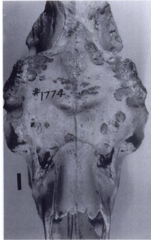
FIGURE 2. Osteoporotic lesions in the skull of an adult male moose from Isle Royale National Park, Michigan. Similar lesions occur in 32% of the skulls collected from 1958 to 1994. Bar = 2 cm.

Net loss of bone is often a progressive, irreversible process, but Parfitt (1976) described temporary reversible mineral deficit as the result of an increase in bone turnover that occurs naturally in pregnancy and antler growth. During pregnancy, calcium required for deposition in the fetal