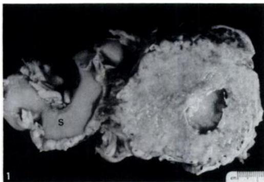
FIGURE 1. Cut section of a large granuloma from peritoneal cavity of a raccoon. The lesion is located near the pyloric region of the stomach (S). Note the central area of cavitation which contained necrotic debris.