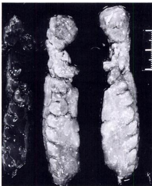
FIGURE 2. Kidneys from a gosling from the coastal area with renal coccidiosis (center, right) and from an uninfected lesser snow goose gosling from the inland area (left). The infected kidneys are swollen, pale and contain many 1 to 2 mm white foci. Scale is in mm.

bular epithelial cells of infected birds. Renal tubular epithelium was hyperplastic in association with parasite infection and moderate numbers of mononuclear inflammatory cells were present in the renal parenchyma. Granulomas were observed occasionally surrounding collections of oocysts. Morphologically, oocytes found in the kidney homogenates were similar to those of Eimeria truncata . Histology was more sensitive than gross examination for detection of coccidial infection ( P < 0.003 ). Oocysts were detected in homog-