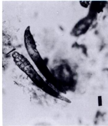
FIGURE 2. Whole mount Demodex sp. in skin scraping from ground squirrel ear canal. Bar = 28.4 \mu m.

Demodex spp. have been described in a wide variety of wild and domestic mammals as well as in humans (Nutting, 1964). They inhabit hair follicles and adnexal glands in numerous locations on the bodies of their hosts. These mites are generally species specific; however, several species of Demodex may parasitize the same host. In such cases, each species is restricted to a particular habitat. An example of this is human infection with D. folliculorum , which lives in the hair follicles of the face, and D. brevis , which inhabits the sebaceous glands (Bowman, 1995). Demodex spp. are believed to be transmitted between hosts by direct contact and usually do not cause clinical signs of disease. In some species, such as dogs infected with Demodex canis , De-