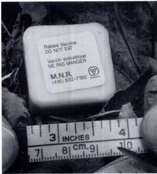
FIGURE 1. The basic physical appearance of the bait for oral rabies vaccination of raccoons to which attractants were added.

bait (3.5 × 3.5 × 1.5 cm in size) (Fig. 1) is outlined in Table 1. Attractants were added to the main ingredients of the baits which were oleo beef stock (Bakers and Us, Rexdale, Ontario, Canada), Microbond® wax (International Wax Ltd., Agincourt, Ontario, Canada) and mineral or vegetable oil (Daminco Inc., Mississauga, Ontario, Canada) (Table 1).