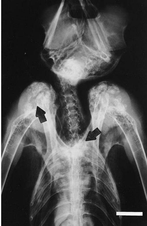
FIGURE 1. Ventrodorsal radiographic view of a great horned owl showing bilateral mineralized foci affecting the scapulo-humeral and sterno-coracoid joints (arrows). Bar = 2 cm

traumatic, degenerative, or inflammatory joint disease and has no sex predisposition (Flo et al., 1987; Pool, 1990). Recently, synovial chondromatosis of unknown etiology was described in a great-horned owl in Iowa (Howard et al., 1996).