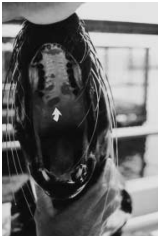
FIGURE 2. Clinical appearance of California sea lion with erupted oral vesicles on hard palate (arrow).

On 8 April 1997 one of the group animals, NIC, was brought to the attention of the veterinary staff with the complaint of poor appetite and reluctance to perform learned behaviors. The following day an erupted vesicle was noted on the sea lion's tongue and calicivirus infection was suspected. Whole blood and serum samples were collected with the animal restrained in a squeeze cage. Amoxicillin (SmithKline Beecham Pharmaceuticals, Philadelphia, Pennsylvania, USA) at 15 mg/kg and clindamycin (The Upjohn Company, Kalamazoo, Michigan, USA) at 12 mg/kg orally, twice daily, were prescribed. On 12 April this animal subsequently developed multiple vesicles of the hard palate and dorsal surface of the tongue, which were causing obvious discomfort (Figs. 1, 2). The animal stayed out of the water with mouth open and refused all fish offered. Topi-