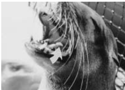
FIGURE 1. Clinical appearance of California sea lion with unerupted oral vesicle on tongue (arrow).

distinguishable from vesicular exanthema of swine, is also described.