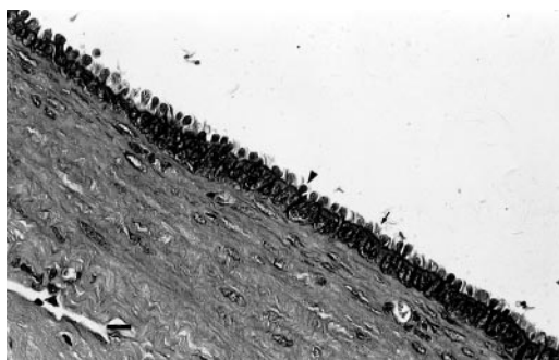
FIGURE 1. Pseudostratified cuboidal epithelium lining the epididymal cyst of a 2.5 yr old bull. The cyst is lined by two kinds of cuboidal epithelial cells; ciliated (↓) and nonciliated with acidophilic droplets seen on the surface (▼). HE. Bar=10 μm.

107 bison. Cysts were present in calves (3 mo–1 yr of age), juveniles (1–3 yr of age), and adults (>3–20 yr of age); frequency of cysts increased with age. Cysts were present in 45% (17 of 38) calves, 69% (20 of 29) juveniles, and 70% (28 of 40) adults. Cysts were unilateral in 35 (54%) animals and bilateral in 30 (46%) of males. The cysts were most common in the head, fewer in the corpus, and were sporadic in the tail of epididymis (Table 1). The cysts in head of the epididymis were rounded and primarily in the anterior region or in the passage between the head and the corpus. In the corpus or tail of the epididymis the cysts usually were pedunculated. The size of cysts varied from 4–20 mm in diameter, but there was no correlation between size and age. The cysts formed an integral part of epididymis, were well delimited, and usually were covered by the capsule. Through the capsule a clear aqueous fluid was discernible.