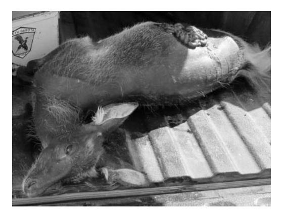
FIGURE 1. White-tailed deer fawn with congenital hypotrichosis collected from eastern South Dakota in October 2001.

ductules were empty or contained sloughed cells admixed with amphophilic to palely basophilic, globular to fibular material. In some sections, widely scattered hair follicles with normal hair-root bulbs extended into the deep dermis. These hair follicles appeared in various stages of hair development. Arrector pili muscles were usually readily evident and appeared to insert near the base of the dilated follicles. Variable sebaceous gland hypertrophy and hyperplasia was present in all sections examined.