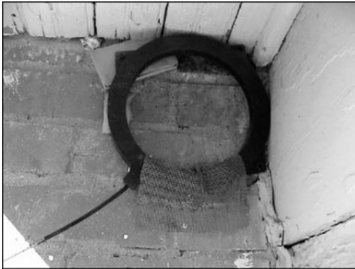
FIGURE 1. A hoop passive integrated transponder (PIT) reader in position to detect PIT tag-carrying bats. The roost exit point is largely hidden above and behind the hoop. Transiting bats possessing subcutaneous PIT tags prefer to pass through the hoop and are recorded. Hoops like this one were used to derive 14-day apparent survival estimates and 1-yr return rates.

were inserted subcutaneously over the lower lumbar region using a single-use disposable syringe presterilized by the manufacturer. The insertion point was sealed with Nexaband ® tissue glue (Closure Medical Corporation, Raleigh, North Carolina, USA). The 0.06 g, 12 × 2.1 mm PIT tags emit an instantaneous (0.04 sec) 125 kHz signal with a unique nine-digit code when they pass within about 15 cm of an activating reader. The presence of individual PIT-tagged bats was passively recorded as they exited and returned from selected roost entrances through permanently positioned circular hoop activating antennas (Figure 1; NEMA readers, Avid, Inc., Norco, California, USA). A 12-V battery-powered data logger was attached to the antenna as part of the NEMA reader system. The data logger stored the digital bat individual identification code, date, and times of detection. These data were downloaded to laptop computers three times each week, and returned to the laboratory where they were entered into a standard query language database. Bats held in hand were scanned for PIT tags using a hand-held Power Tracker IV reader (Avid).