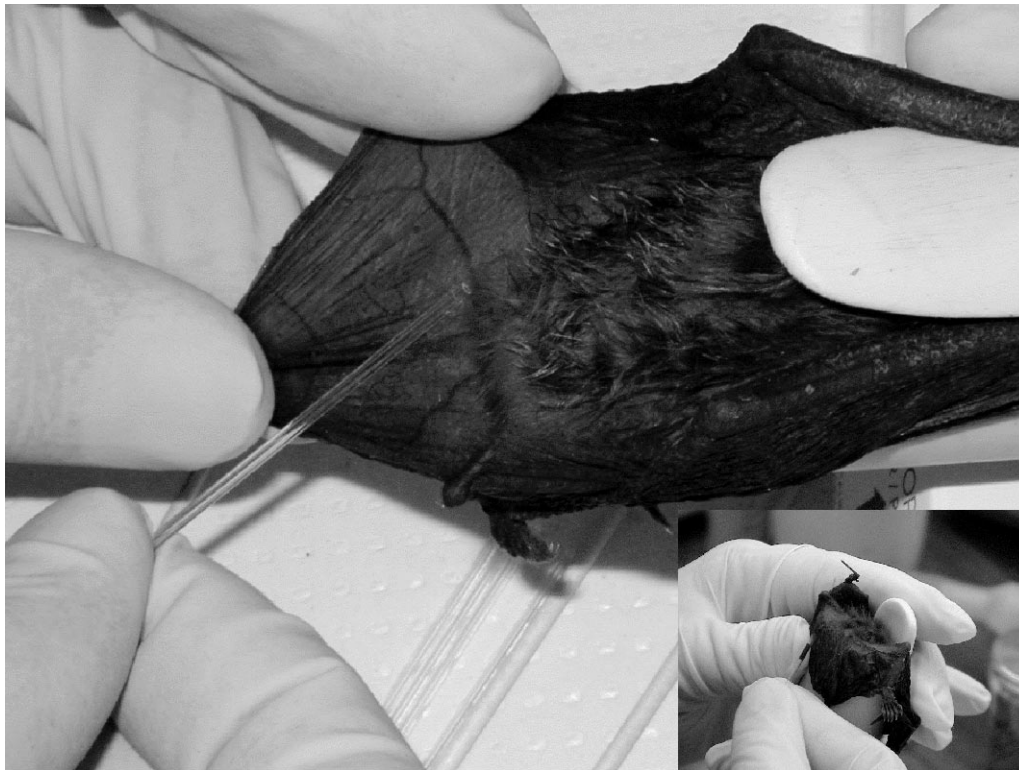
FIGURE 3. A big brown bat restrained in the anesthetic induction capsule with engorged left inter-femoral vein. Blood is collected using a 75- \mu l heparinized hematocrit tube after lancing the vessel with a 27-gauge needle (inset).

manifold. Thus, six separate patient circuits, each with their own endotracheal fitting and anesthetic induction capsule, allowed anesthetic induction and maintenance of up to six bats simultaneously. Initial induction consisted of 4–5% isoflurane and 1 l/min oxygen delivered per bat. Anesthesia was maintained at 2–3.5% isoflurane, using the same oxygen flow rate. Each capsule was disinfected with alcohol between uses. Collection of blood was made by initially warming the site with a hot water bottle until inter-femoral vein engorgement was evident in the tail membrane (Fig. 1). A 27-gauge needle was used to lance the inter-femoral vessel, typically from the dorsal aspect. Blood was collected into multiple heparinized hematocrit tubes (75 \mu l; Fisher Scientific, Pittsburgh, Pennsylvania, USA). The goal was to collect under 1% of body weight in blood volume equivalent from each bat. In some cases, bilateral vessels were accessed to guarantee an adequate sample. Hemostasis was accomplished by applying direct pressure with cold packs, or rarely by application of hemostatic gel (Cauter-Gel, Mensa Products, Fort Lauderdale, Florida, USA). Bats were observed until recovery, then