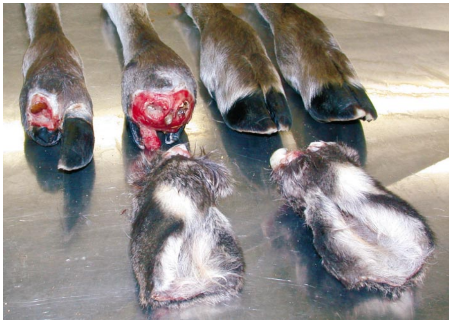
FIGURE 2. Moose calf (no. 1) showing unilateral (left) and bilateral loss of the distal and medial phalanx of the two hind limbs, as well as both ear tips. The forelimbs are normal. Swelling and exposure of the medullary cavity of the proximal phalanges are seen in the limb with bilateral lesions.