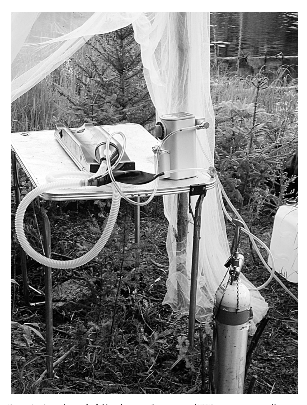
FIGURE 2. Surgical setup for field implantation of intraperitoneal VHF transmitters into wolf pups using sevoflurane. The setup included an oxygen cylinder with a dial-up combination regulator/flowmeter, a sevoflurane vaporizer placed on the table with a Bain's anesthetic circuit, the respective hosing, and a tight-fitting anesthetic face mask.

adhesive (VetBond, 3M, London, Ontario, Canada) to the skin wound.