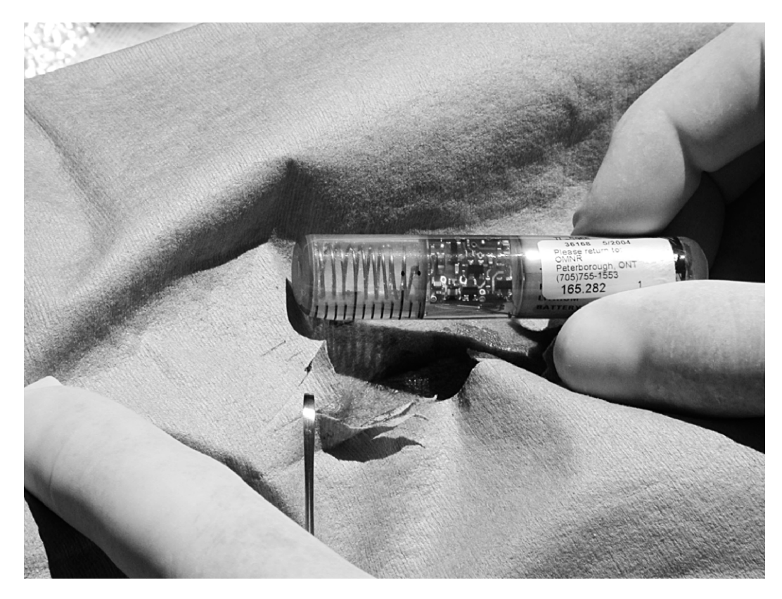
FIGURE 1. A detailed view of an intraperitoneal VHF radio transmitter (7.9-cm length \times 1.7-cm diameter; ATS, Isanti, Minnesota, USA) prior to insertion into the peritoneal cavity of a 5-wk-old wolf pup in Algonquin Provincial Park. The implant consisted of a lithium battery (right), circuit board (middle), and a coiled antenna (left) packaged in a biologically inert resin.

Animal Health, Guelph, Ontario, Canada) (0.1 mg/kg) for sedation and intra-operative analgesia. Anesthesia was then induced with 8% sevoflurane (Sevoflurane, Abbott Laboratories, St. Laurent, Quebec, Canada) in oxygen with a flow rate of 2-3 l/min via a tight-fitting anesthetic face mask. The anesthetic apparatus consisted of a precision sevoflurane vaporizer (Penlon Sigma Delta, Penlon Ltd., Abingdon, Oxon, UK), a D- or E-size aluminum oxygen cylinder, a dial-up combination regulator/ flowmeter (Model 3108-L, Inovo Inc., Naples, Florida, USA), a Bain's anesthetic circuit, and a 2-m hose for waste gas. Total weight of the apparatus including the aluminum oxygen cylinder was 11.4 kg with the E-size cylinder, and just 9.7 kg with the smaller D-size cylinder.