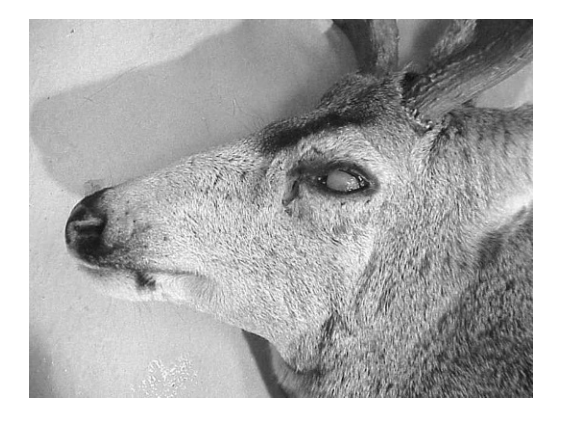
FIGURE 1. Mule deer ( Odocoileus hemionus ) from Wyoming with keratoconjunctivitis caused by Yersinia pestis infection.

The buck was alert and recumbent in a field, apparently blind, reluctant to stand, and ran into foreign objects when pressured. The deer was killed by gunshot to the thorax and submitted for necropsy to the Wyoming State Veterinary Laboratory (WSVL) (Laramie, Wyoming, USA).