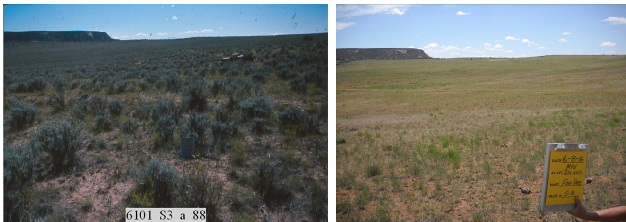
Fig. 1. Photos from 1988 prefires and 2016 postfires in the Fish Park area.