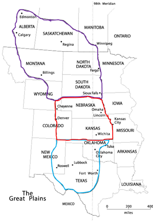
Figure 1. Map of the Great Plains showing three main regions: (1) Northern Great Plains (marked by purple line), (2) Central Great Plains (marked by red line), and (3) Southern Great Plains (marked by light blue line). Adapted from Center for Great Plains Studies, University of Nebraska–Lincoln.