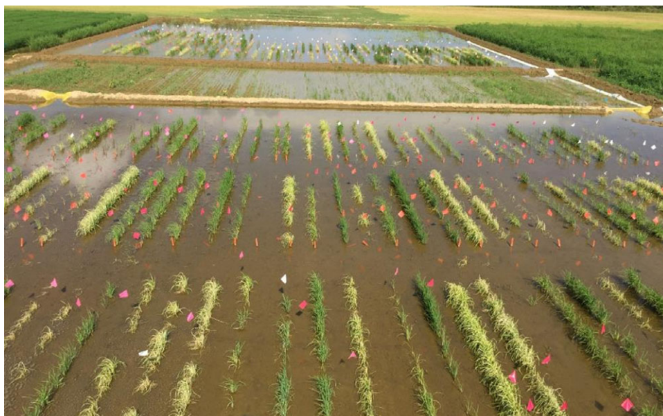
Figure 7. Individual rows of weedy rice accessions or cultivated rice cultivars 8 d following a post-flood application of benzobicyclon at 371 \text{ g ai ha}^{-1} . Healthy rows are cultivated rice or resistant weedy rice accessions, whereas chlorotic rows are benzobicyclon-sensitive weedy rice accessions.

and complete loss of the crop can occur at higher densities in some instances (Smith 1988; JKN, personal observation). In addition to crop yield loss from interference, O. sativa f. spontanea at high densities often results in lodging of the cultivated crop, which further complicates harvesting.