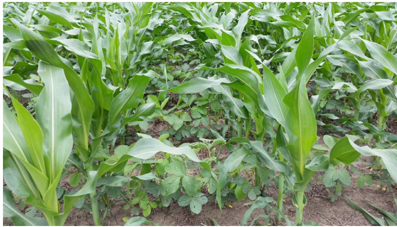
Figure 8. Volunteer soybean in a cornfield in Nebraska.

2009 (Fernandez-Cornejo et al. 2016) and 98.5% in 2013 (ISAAA 2014).