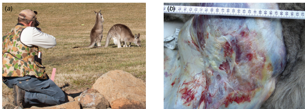
Fig. 2. Darting of adult eastern grey kangaroos ( Macropus giganteus ) for fertility control, south-eastern Australia, 2015. (a) A dart fired at the rump of a habituated kangaroo and (b) post-mortem assessment of ballistic pathology from dart impact and remote injection 5 days post-darting.

Before operational use of adult seal shooting, to our knowledge, no research trials (benchtop, post-mortem or pilot studies) were undertaken to determine the effectiveness of different firearm-bullet configurations at different distances for rendering adult seals immediately insensible. Such trials have been performed for juvenile seals (Daoust and Cattet 2004; Daoust et al. 2013) and have been associated with desirable animal welfare outcomes (absence of struck-and-lost seals and a high frequency of immediate insensibility; Daoust and Caraguel 2012). The lack of ballistic trials before the operational use of adult seal shooting is likely to have contributed to the poor animal welfare outcomes