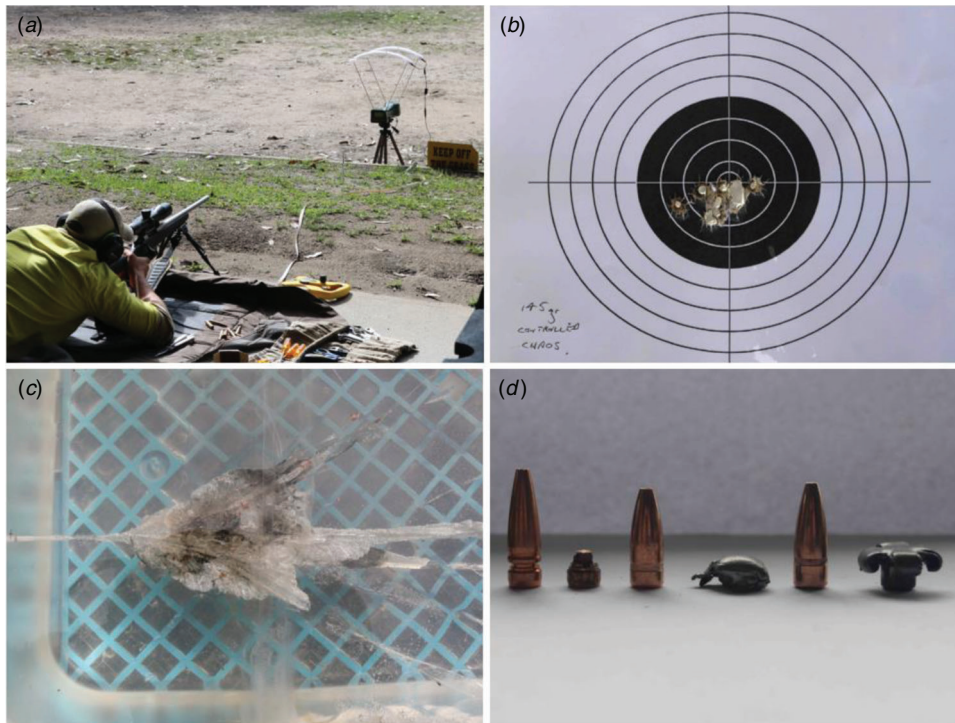
Fig. 1. Shooting range methods used for testing new ballistic technology before beginning animal-based trials, eastern Australia, 2018. (a) Use of a chronograph to measure projectile velocity, (b) assessment of precision through shot grouping, (c) use of tissue simulant gel to assess terminal ballistics patterns, and (d) examination of bullet weight retention and deformation.