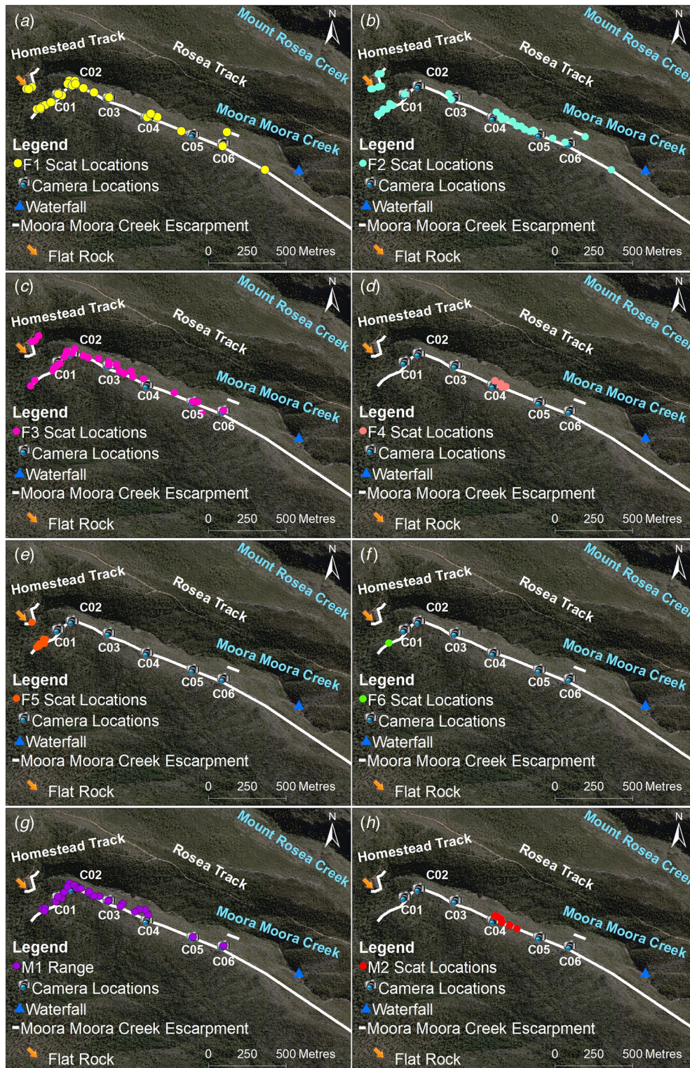
Fig. 3. Locations of brush-tailed rock-wallaby ( Petrogale penicillata ) scats of genotyped (a) female F1, (b) female F2, (c) female F3, (d) female F4, (e) female F5, (f) female F6, (g) male M1 and (h) male M2. Animals are part of the reintroduced colony in Grampians National Park, Australia. C01–C06 indicate the positions of the six remote cameras monitoring the site.