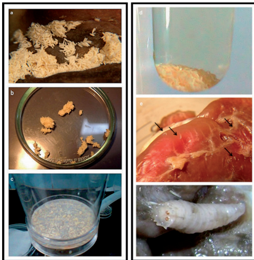
Fig. 1. Demonstrative scheme of the sterilization process sequence: (a) egg mass on chicken gizzard protein diet; (b) egg mass transferred aseptically to a Petri dish for weighing and separating for disassociation; (c) Bactor Sterile monitor filter cup and 0.8- \mu\text{m} Whatman filter paper with sterilized egg mass; (d) sample of sterilized egg mass transferred to test tube containing 10-ml TSB and FTB for the sterility test; (e) hatched larvae after 12 h transferred to chicken gizzard diet; and (f) larvae with normal development. Only the larva viability is shown in this study.

Egg masses from ninth generation female C. putoria of the stock colony were transferred, using sterile tweezers, to a microscope glass slide and then weighed on semianalytical scales until 0.600 g total weight was gathered and divided into three equal parts of 0.200 g. The parts were then transferred to sterile Petri dishes and mixed with 4 ml of sterile distilled water to disaggregate eggs that were separated mechanically using a no. 0 paintbrush. The egg suspension obtained was transferred aseptically to a test tube containing a 20 ml of 2% glutaraldehyde solution and activated by raising the pH to 8.0–8.2 with the addition of 0.4% sodium bicarbonate and 0.05% monobasic sodium phosphate. After 15 min of contact, the tube contents were filtered through a 0.8- \mu\text{m} thick, 2-cm diameter Whatman filter paper disc placed in a sterile plastic base (100-ml Bactor Sterile monitor cup), supported by a Kitasato flask. Immediately after filtration, the filter paper was rinsed with 30 ml of TSB to neutralize any glutaraldehyde residue that might have toxic effects on the eggs. Under aseptic conditions, the eggs were transferred to a gauze surface moistened with 0.9% sterile saline