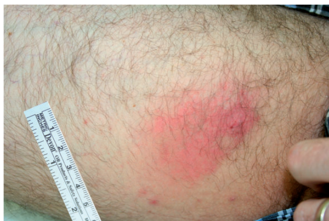
Fig. 2. Erythema migrans with tick just removed.

using the Eco Real-Time PCR system from Illumina San Diego USA, with software version 3.0.16.0. DNA was extracted from the tissue. The two samples were analyzed in duplicate with positive and negative controls using primers and probe AB-B1 (proprietary to Australian Biologics) for the Borrelia 16S rRNA gene. The thermal profile for both analyses involved incubation for 2 min at 50°C, polymerase activation for 10 min at 95°C, then PCR cycling for 40 cycles of 10 s at 95°C and 45 s at 60°C. The positive control used was an ATCC B. burgdorferi genomic control. Validation of the assay was produced by use of external sequencing and through participation in quality assurance programs for the detection of Borrelia by PCR with Quality Control for Molecular Diagnostics in Glasgow, UK. The extracted tissue DNA was then used in a Borrelia sequencing endpoint PCR assay targeting the 16S RNA gene using 12.5 µl of Go-Taq (Promega), 1.5 µl of both forward and reverse primers, 4.5 µl H 2 O and 5.0 µl of DNA in a total volume of 25 µl. Primers are proprietary to Australia Biologics. Cycling conditions were an initial denaturation of 94°C for 4 min, then 94°C for 60 s, 60°C for 60 s, and 72°C for 60 s for 45 cycles with a final extension of 10 min at 72°C. PCR products were analyzed by standard 2.5% agarose gel. The amplicon was eluted from the gel and purified. The amplicon was 286 bp and was sequenced at the Australian Genome Research Facility in Sydney, Australia.