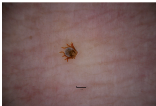
Fig. 3. Dermoscopic view of apparent I. holocyclus nymph tick still attached.

The Ticks. Macroscopic and microscopic analysis at Newcastle and Queensland universities confirmed morphologically that the specimens appeared to be nymphs of the I. holocyclus tick. Morphologically, they were either I. holocyclus (Neumann 1899) or I. cornuatus (Roberts 1960). Molecular analysis showed that the fragments of the tick