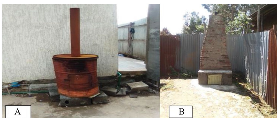
Figure 4. Sample photos of (A) unacceptable incinerator and (B) acceptable incinerator used to treat dry and infectious wastes.