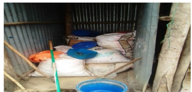
Figure 3. Sample photo of not well fenced waste storage practice.

feedback from regulatory bodies were the significant predictor for proper healthcare waste management practices in private clinics. This finding is supported by studies done in India. 34,35 This might be because of the fact that both supportive supervision and presence of guidelines increased the knowledge and adherence of health professionals for waste management.