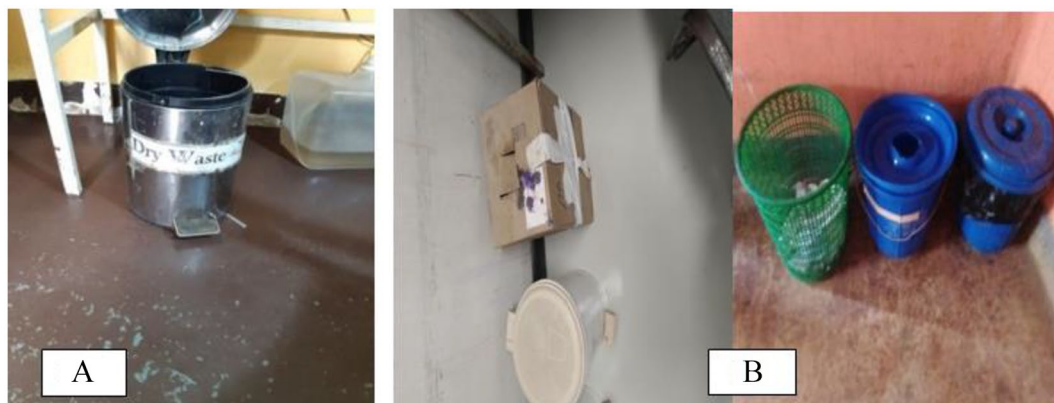
Figure 1. Photos to show (A) good waste collection and segregation bins and (B) improper waste collection and segregation bins.

This study was conducted to assess healthcare waste management practices in private clinics in Addis Ababa city, Ethiopia and found that 61.2% of the clinics had poor healthcare waste management practices, out of which, 56.8% had poor waste segregation practice, 55.0% had poor waste collection practice, 85.6% had poor waste transportation practice, 63.3% had poor waste storage practice, 61.9% had poor waste treatment, and 57.9% had poor disposal system. This suggests that private clinics in Addis Ababa did not meet the WHO recommendations for medical waste management, 2,15 which is in agreement with reports of studies in Africa. For instance, a systematic review conducted to assess solid medical waste management practices